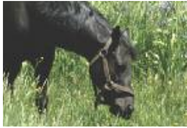
Front Cover Tower Hill Equestrian Center, North Kingstown